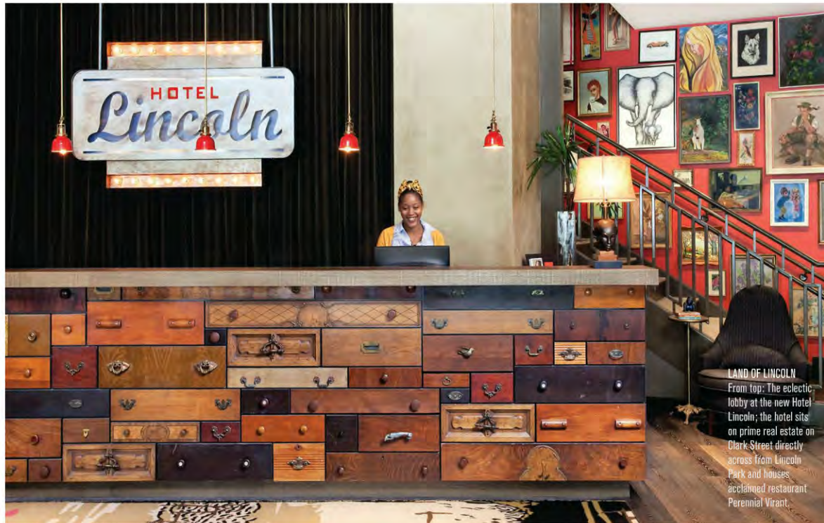
LAND OF LINCOLN From top: The eclectic lobby at the new Hotel Lincoln; the hotel sits on prime real estate on Clark Street directly across from Lincoln Park and houses acclaimed restaurant Perennial Virant.

It's hard to beat waking up in a slick suite at a beautiful downtown hotel, walking to the window with your coffee, and taking in the glistening skyscrapers and bustling streets dozens of floors below. But with the opening of the new Hotel Lincoln, in-the-know travelers have what is perhaps Chicago's first real alternative to the titans of downtown hospitality.