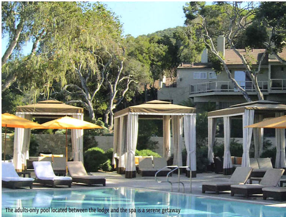
The adults-only pool located between the lodge and the spa is a serene getaway

The Pete Dye-designed golf course with views of lush woods and expansive mountains draws many guests, as do the nine tennis courts, basketball court, two bocce ball courts, two saltwater pools, splash zone for kids, the fitness center that offers a daily menu of classes, and the new Spa Aiyana. Guests can also don protective gear and try their hand at harvesting honey under the supervision of a certified beekeeper. Cooking classes are another option.