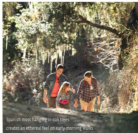
Spanish moss hanging in oak trees creates an ethereal feel on early-morning walks

That night — feeling very relaxed — we enjoyed a casual meal at the River Ranch Café, where we sat outdoors under a starry sky and enjoyed the bonfire and lap robes provided by