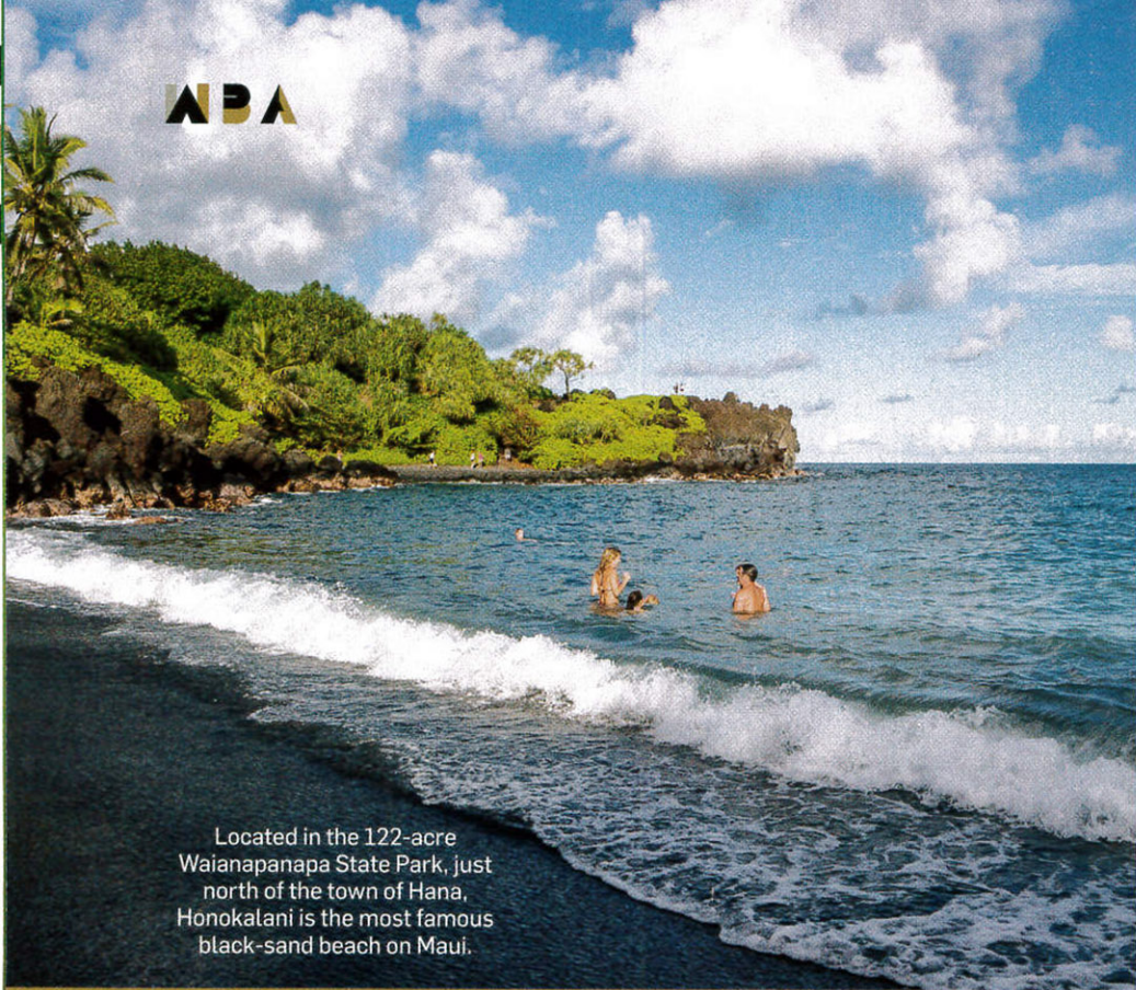
Located in the 122-acre Waianapanapa State Park, just north of the town of Hana, Honokalani is the most famous black-sand beach on Maui.