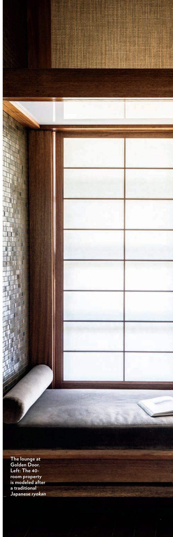
The lounge at Golden Door. Left: The 40-room property is modeled after a traditional Japanese ryokan

Body products, jackets, yoga mats and even artisanal cookies and honey are available to bring the Golden Door experience home.